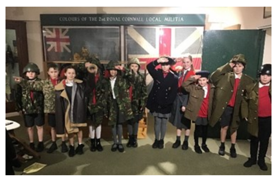
Landulph School Class 3 trip to Bodmin Keep as part of their WW2 learning (see next page)