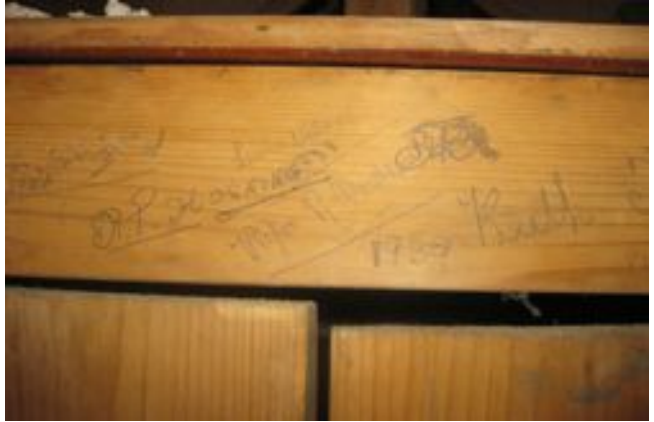
Signatures on the beam