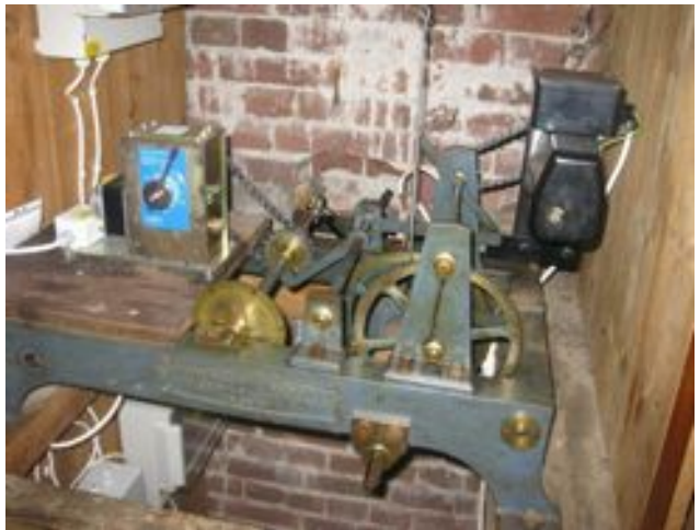
The workings of the clock