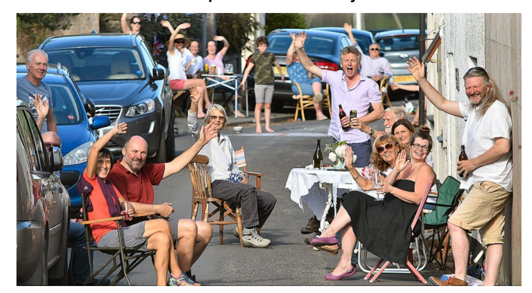
The photo above has been taken with a telephoto lens which can distort the perspective. People are in groups of household units and are two metres apart from other groups

The parish made a brave effort to celebrate VE-Day on Friday 8 May despite the Coronavirus lockdown. Impromptu and socially distanced tea parties and street parties sprang up all over the village of Cargreen. Live music was provided by an ad hoc group in Coombe Drive while hopscotch featured in the biggest party in Fore Street where several households came loosely together to celebrate the declaration of peace.