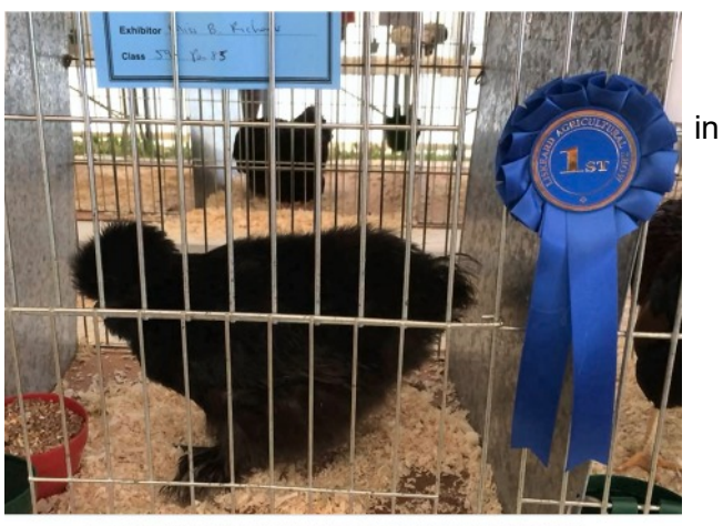
MY SILKY HEN CALLED LADY H

I am hoping to start a local fun poultry group Landulph. The purpose of the group will be to meet up with like-minded people, share experiences and hopefully to gain extra knowledge and some friends too. The club would be open to any age and anyone who currently has, used to have or