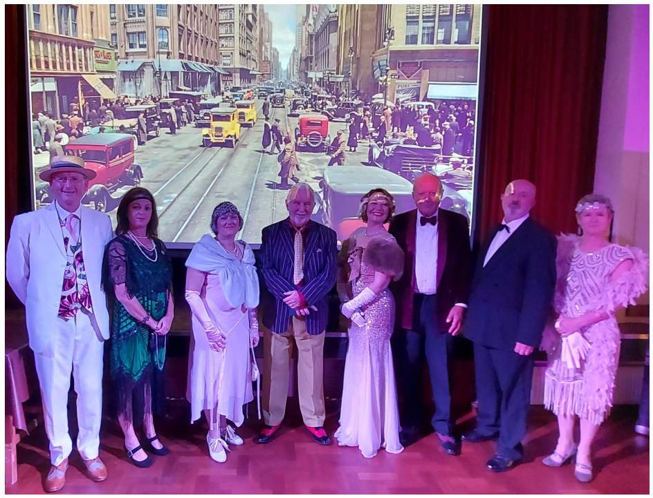
The cast from the Murder Mystery evening and innuendos leading an analytical minority deduce who might have committed the actual deed. The audience entered fully into the spirit of the occasion, many dressing for the period and appreciating cocktails at the Bar to complement their three-course meal prepared by the committee; a huge thank-you to them for their hard work. Freshly Squeezed, a fantastic funk and soul band, created a full-blown evening of music and dancing, with all ages, pensioners downwards, inspired to take to the dance floor. The Stowes from Padstow, a Celtic and Ceilidh band played shanties and other Cornish songs to keep the audience's feet tapping for most of the evening.

Landulph Festival 2023 has enjoyed one of its most successful years yet with a total audience of almost 700 enthusiastic supporters over the four weekends. It always amazes me that a single fund raising project for the church roof started 22 years ago has developed into the four weekends of varied events of music and art that an ever increasing audience enjoys today. This year's Festival featured eight events over four weekends combined with the ever-popular local art exhibition. The programme began with an interactive murder mystery evening. Gatsby's murder took place at the end of the show with a lot of clues