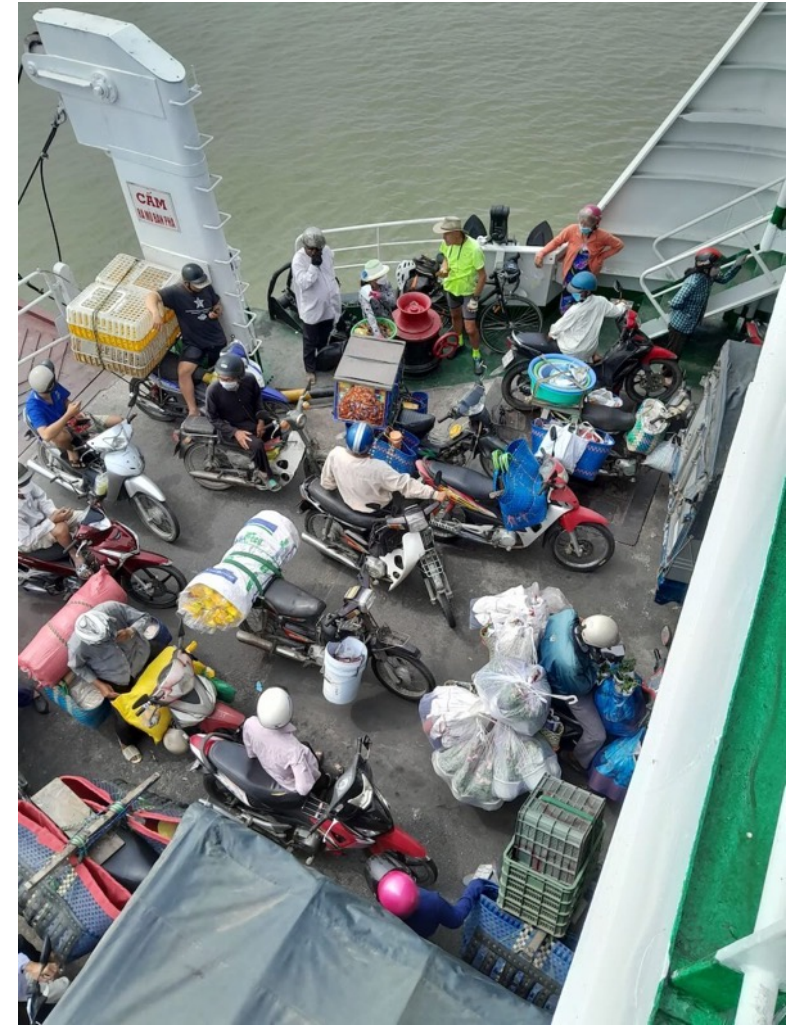
Crossing the mighty Mekon River by ferry