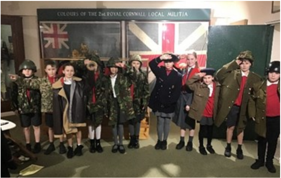
Landulph School Class 3 trip to Bodmin Keep as part of their WW2 learning (see next page)