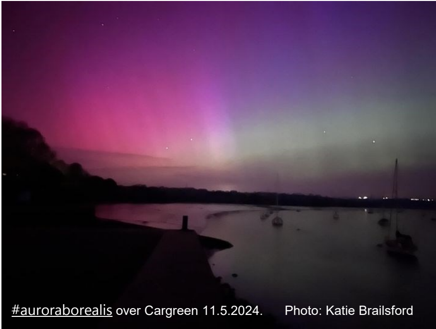
#auroraborealis over Cargreen 11.5.2024.