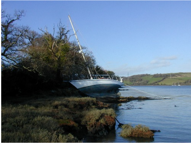
Storms left one yacht high and dry