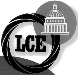
Photo Optical Digital