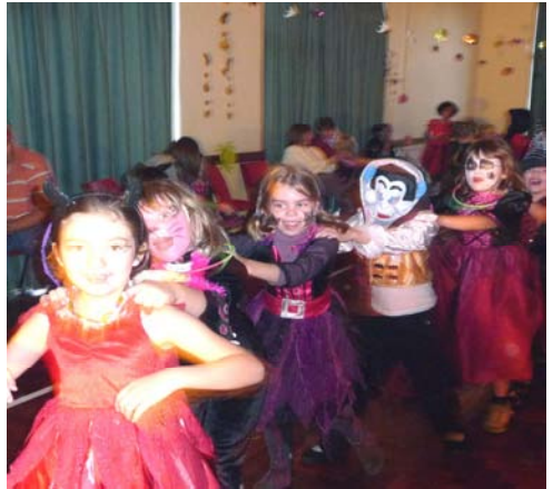
Right, Children enjoying the disco

Landulph under fives committee hosted a Halloween disco on 24 October, which included a Pop-kids session (for under-fives), a disco and fancy dress. Ghoulish fun was had by all and we managed to raise £50 for the Under Fives' funds