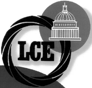
Photo Optical Digital