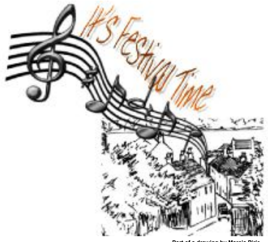
Part of a drawing by Marcia Pirie

October / November 2011 No 35 Your guide to what's happening in the area