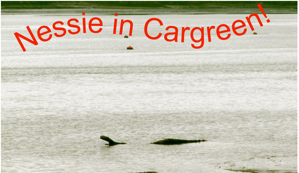
This striking photograph, taken by an intrepid local photographer sometime before 1 April shows a strange monster uncannily like the Loch Ness Monster, swimming in the Tamar off Cargreen. Could the river be a spawning ground for prehistoric reptiles? The Newsletter is investigating!