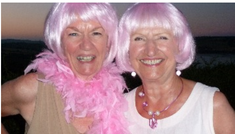
The Pink Ladies