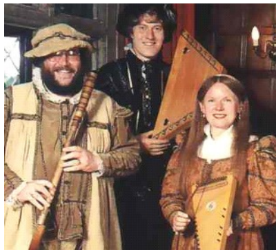
Dragonsfire, our entertainers for the evening