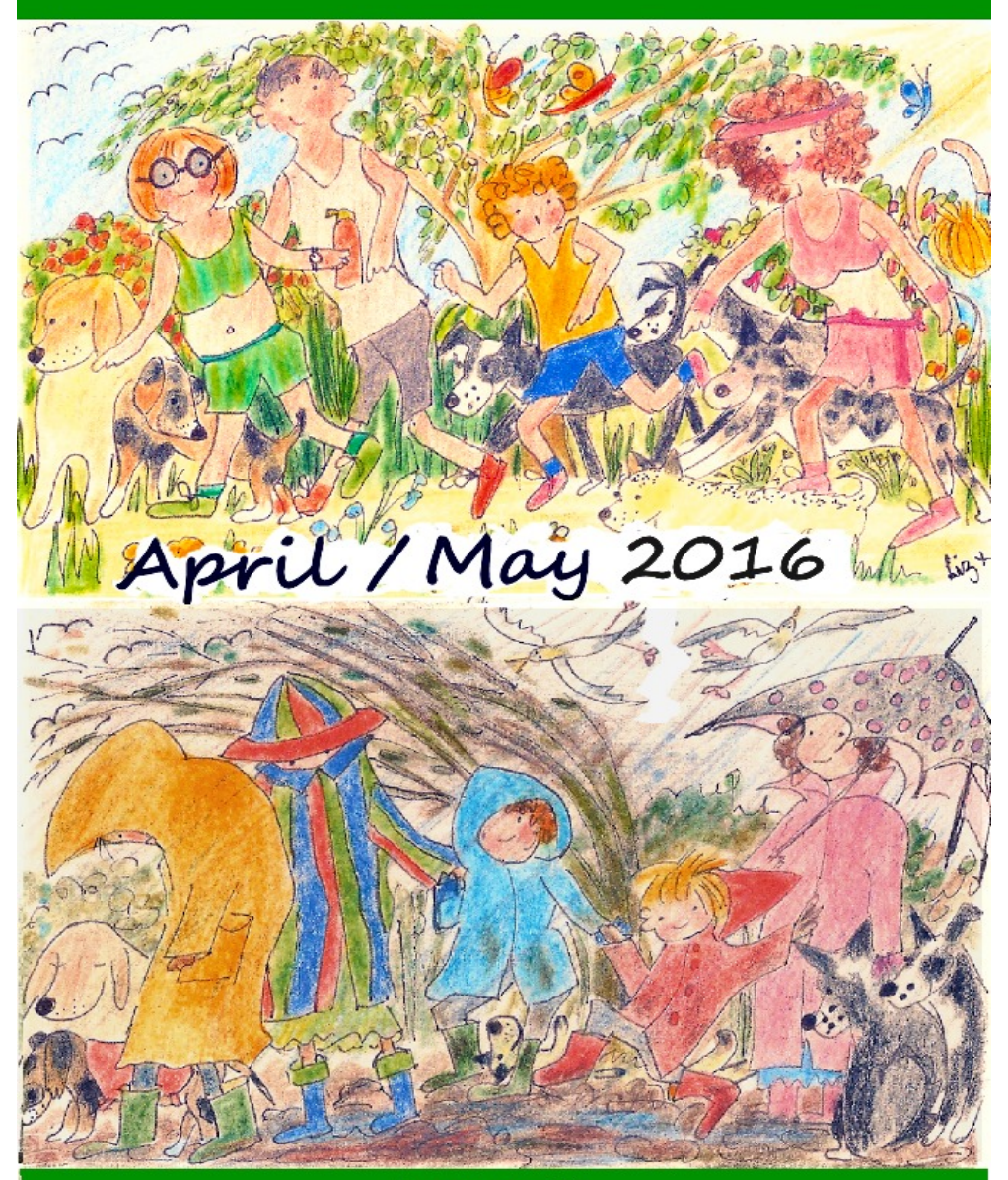
issue no. 62 Your guide to what's happening in the area