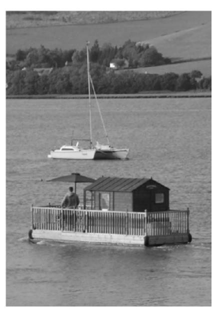
The first raft of measures to address affordable housing