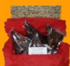
Brownie Hampers 6 varieties to choose from