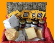
Cornish Savoury Tea Hampers

Full of freshly baked Christmas goodies Surrounding your Choice of a Cornish Cream Tea or Cornish Savoury Tea Delivered Direct! Take the stress out of Christmas!