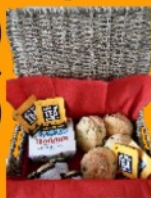
Cornish Cream Tea Hampers