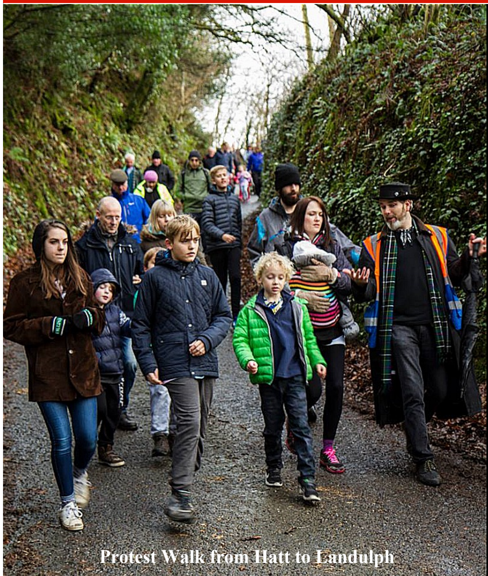
Protest Walk from Hatt to Landulph

Your guide to what's happening in the area Issue no. 73 February/March 2018