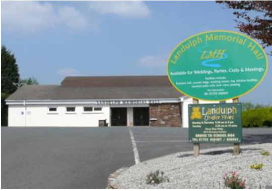
Landulph Memorial Hall