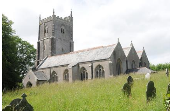
St Leonard and St Dilpe