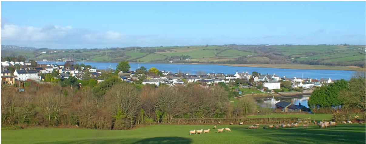
Village of Cargreen