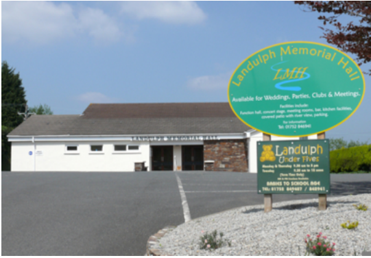
Landulph Memorial Hall