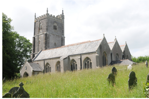
St Leonard and St Dilpe