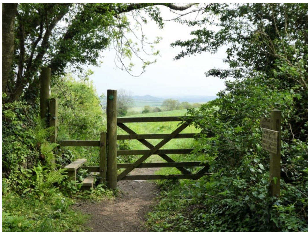
Footpath in the Parish

iii. it acknowledges the local importance of valued green and open spaces, and makes provision for the long-term maintenance of any green infrastructure directly related to the development - see Appendix A.