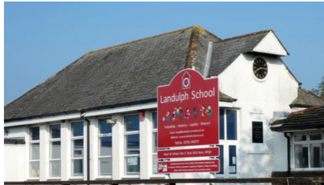
Landulph Primary School showing the World War One Clock