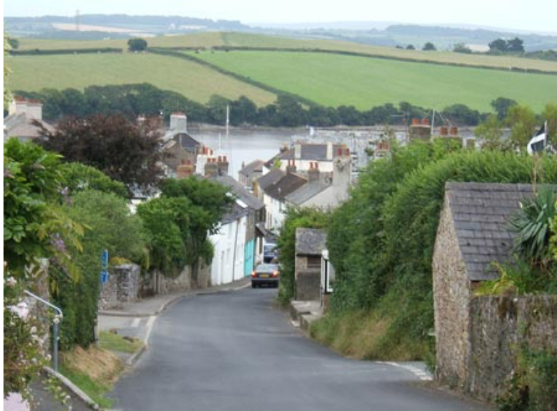
Cargreen Village looking towards the Tamar river