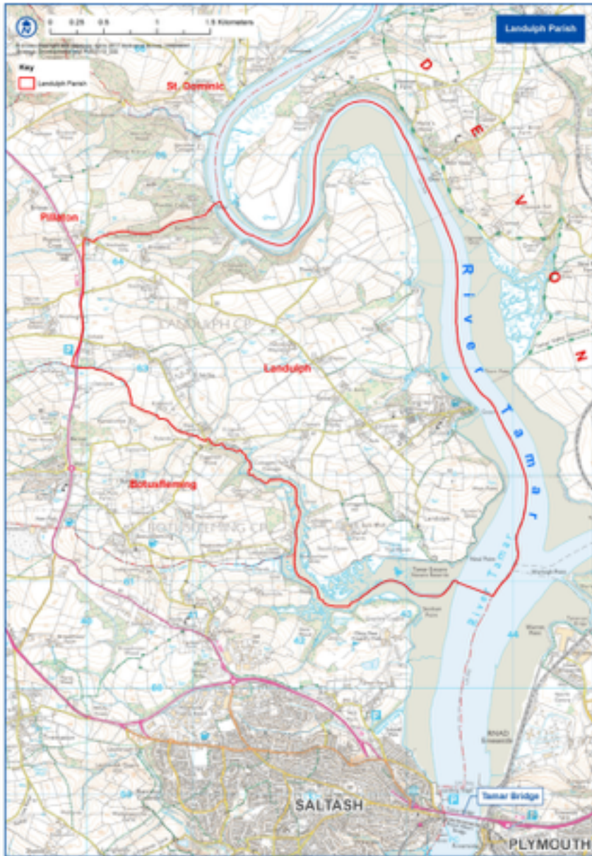
Figure 1. Designated NDP Area for Landulph Parish NDP.