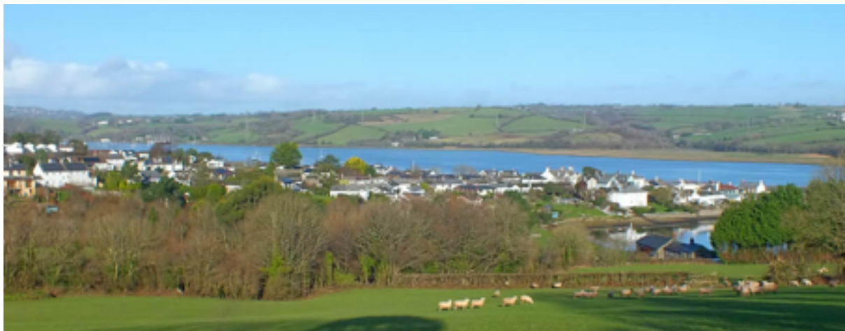
Village of Cargreen