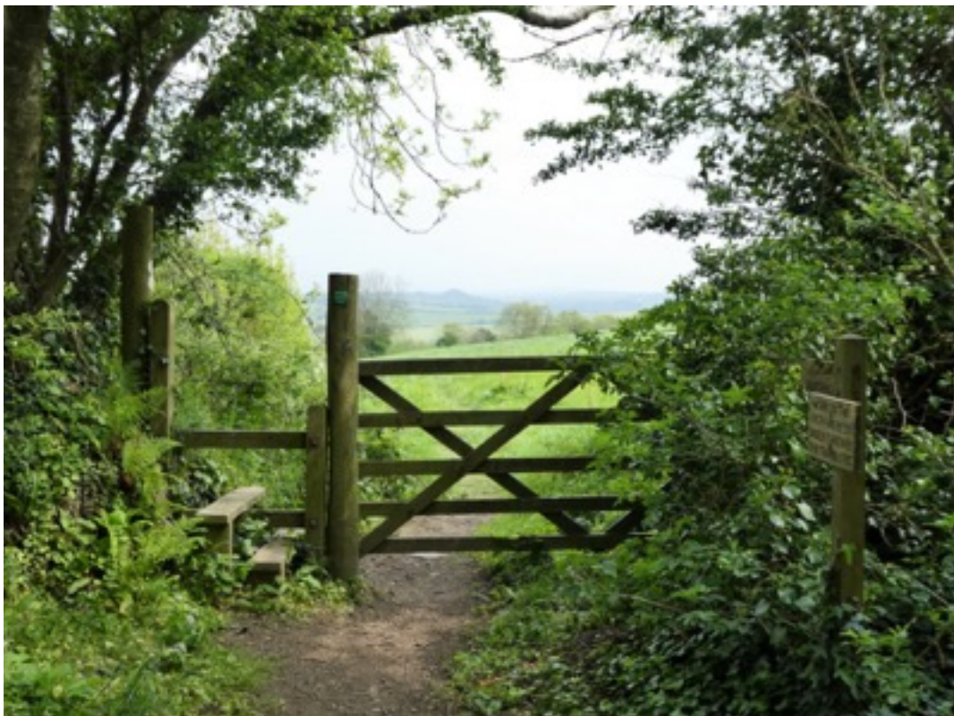
Footpath in the Parish