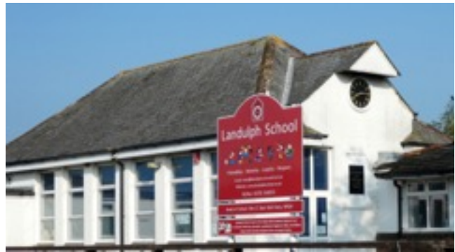
Landulph Primary School, showing the World War One Clock