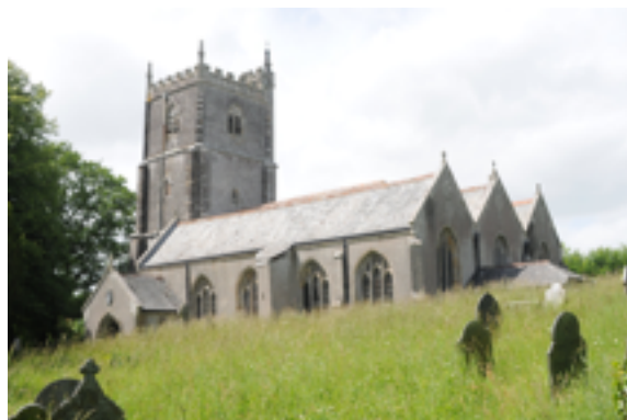
St Leonard and St Dilpe