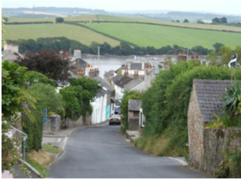
Cargreen Village looking towards the Tamar river