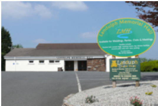
Landulph Memorial Hall