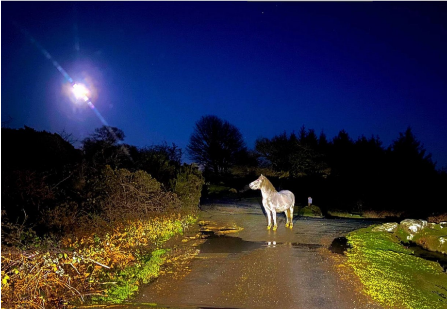
Recent night time photo by Debbie Geraghty of Dartmoor Pony