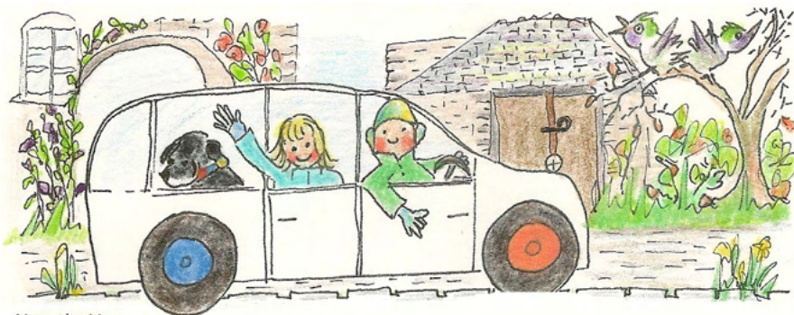
Vera the Van