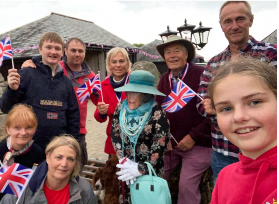
The party at Stockadons Barns