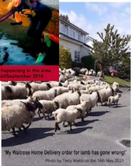
'My Waitrose Home Delivery order for lamb has gone wrong!' Photo by Terry Webb on the 14th May 2021

June / July 2012 No 39 Your guide to what's happening in the area