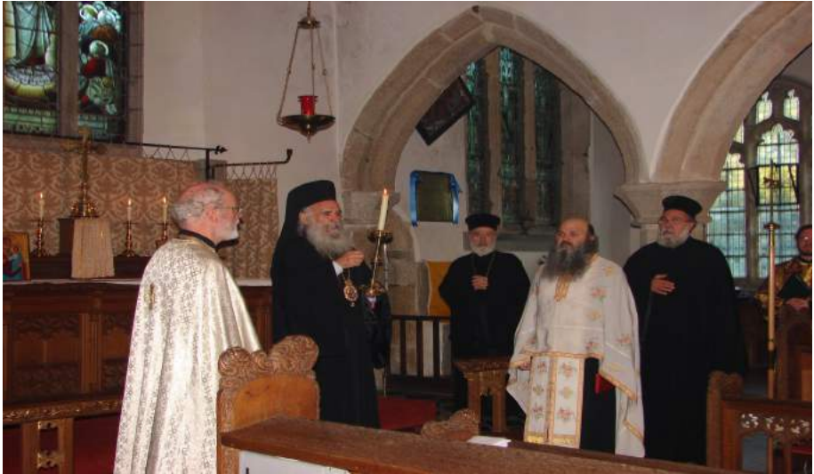
Archbishop Gregorios and members of the Greek Orthodox Church, Landulph 2007