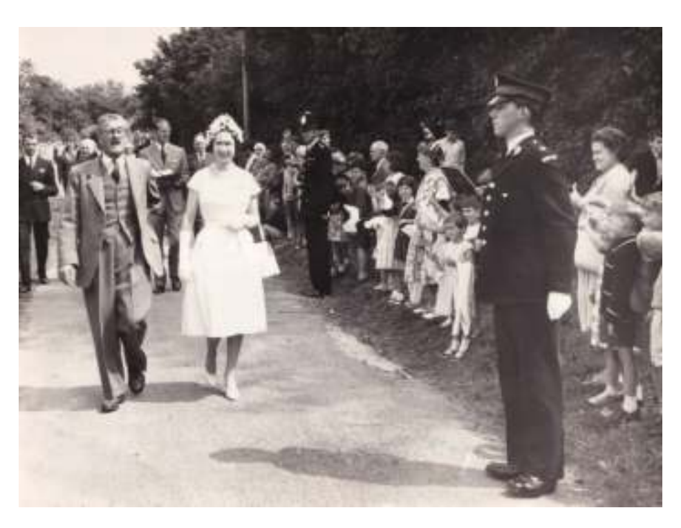
Queen Elizbeth's visit to Landuph in 1962