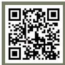
Scan for tickets & more details *Booking essential