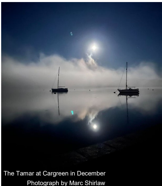
The Tamar at Cargreen in December

On the planning front the Council discussed and approved plans for the installation of a battery storage facility at the National Grid sub-station at Ellbridge Lane. This would involve underground cabling, fencing, drainage and landscaping.